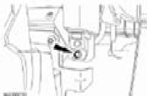
Fig. 49: Locating Center Instrument Panel Trim Panel Lower Bolt.