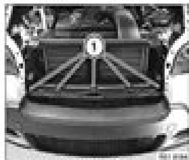
Fig. 11: Release Screws (1) On Front Frame