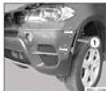
Fig. 14: Unclip Wheel Arch Cover (2) At Front On Left And Right

Unclip wheel arch cover (2) at front on left and right.