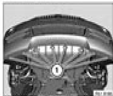
Fig. 12: Release Screws (1) Under Vehicle

Loosen screws (1) on the right and left of the wheel arch cover (2). Installation note: Make sure wheel arch cover (2) is in correct position.