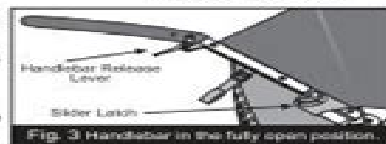
Fig. 3 Handlebar in the fully open position.