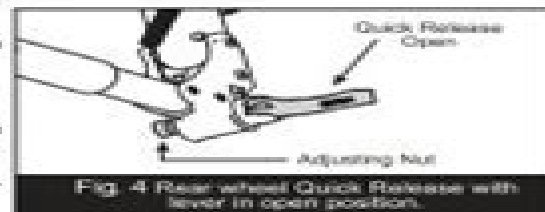
Fig. 4 Rear wheel Quick Release with lever in open position.