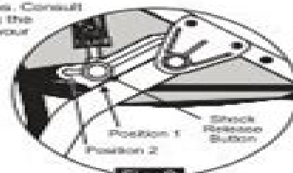
Fig. 2 Swingarm in unfolded position with shock in position 1.

Place the rear wheel quick release lever in the open position, as shown in Fig. 4. Insert the rear wheel's stub axle into the hole in the rear dropout. If the axle does not slide in easily, loosen the quick