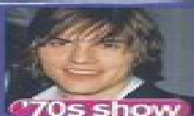
'70s show Is Ashton leaving?