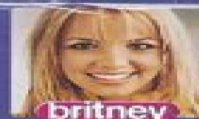
britney A sticky new project