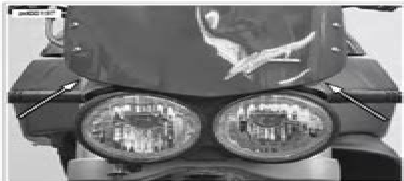
Figure 1-50. Horizontal Headlamp Adjustment Fastener Locations: Lightning

Only loosen headlamp alignment fasteners enough to adjust headlamp. Once headlamps are aligned, tighten fasteners to 48-72 in-lbs (5-8 Nm).