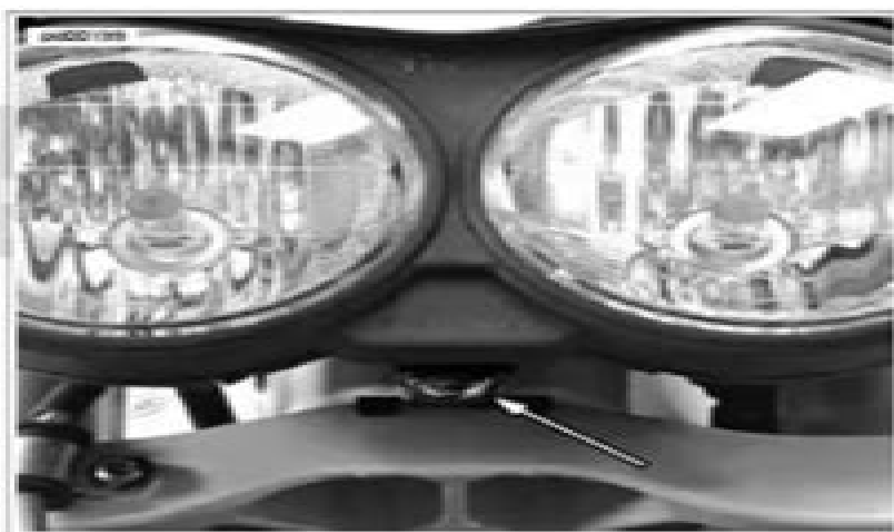
Figure 1-52. Vertical Headlamp Adjustment Fastener: Lightning Models