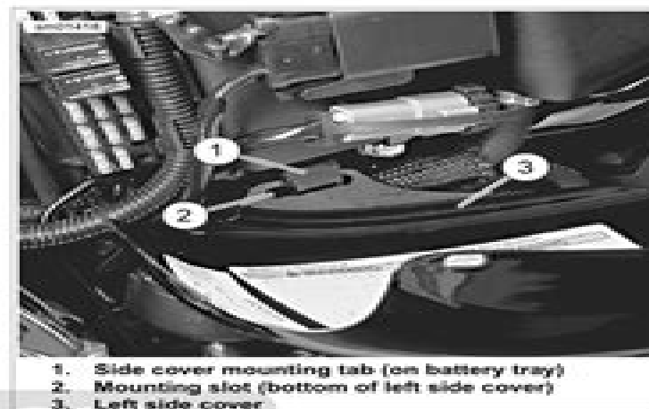
Figure 2-162. Left Side Cover in Open Position: All Models (XL Model Shown)

Leaning or placing tools on side cover could cause damage to cover and/or mounting tab on battery tray. (00523b)