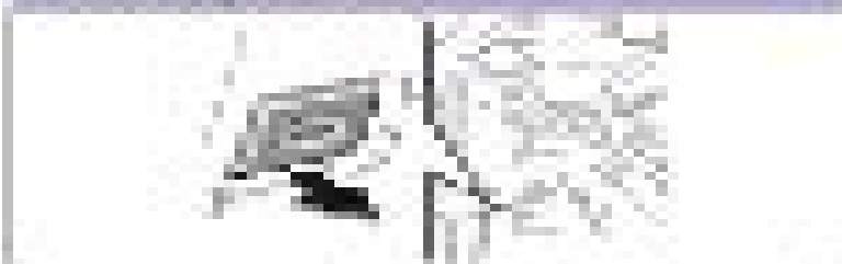
Diagram of the Brake Pad Wear level inside the vehicle.