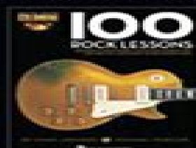
100 ROCK LESSONS (HL00696-453)