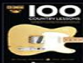
100 COUNTRY LESSONS (HL00696-453)