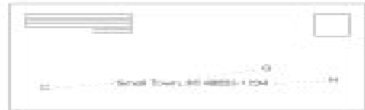
Addressed Envelope 2